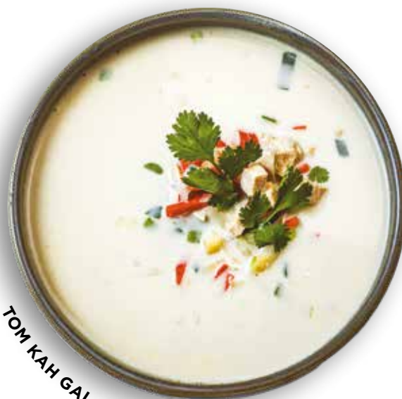
TOM KAH GAI