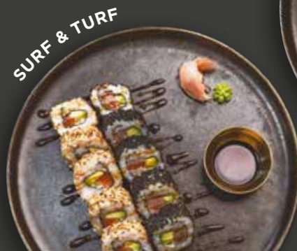
SURF & TURF