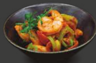
GAMBAS AL AJILLO