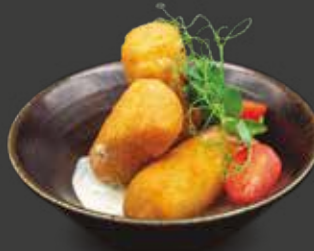
CROQUETAS DE JAMÓN