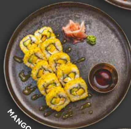
MANGO & TOFU