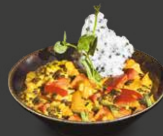
LENTIL COCONUT CURRY