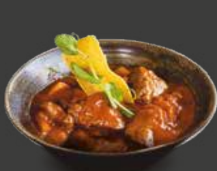
BEEF FILLET STRIPS