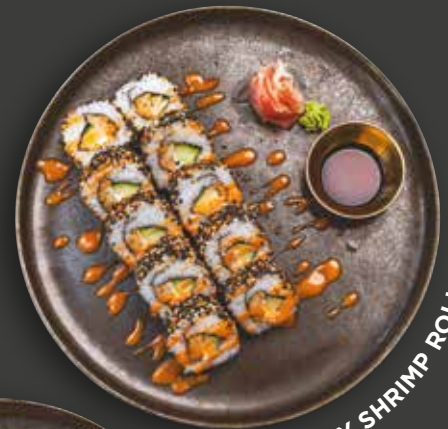
CRISPY SHRIMP ROLL

Smoked duck, carrot, cucumber, cream cheese, black sesame and hoisin sauce