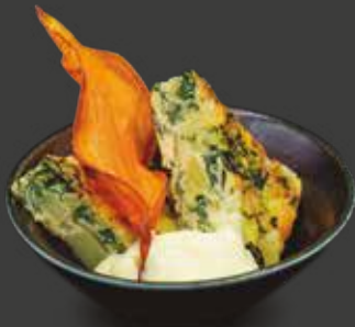
TORTILLA DE QUESO