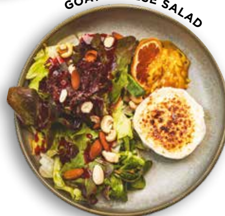
GOAT CHEESE SALAD