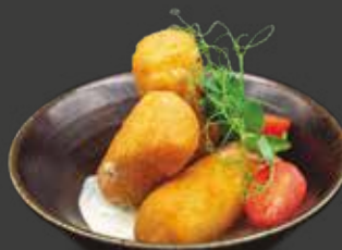
CROQUETAS DE JAMÓN