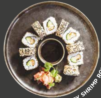
CRISPY SHRIMP ROLL

salmon, steak, avocado, celery stalk, Philadelphia with Teriyaki