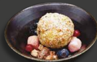
CURD NOUGAT DUMPLINGS