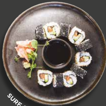
SURF & TURF