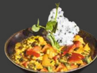
LENTIL COCONUT CURRY