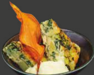
TORTILLA DE QUESO