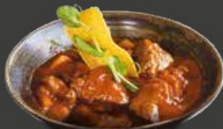
BEEF FILLET STRIPS