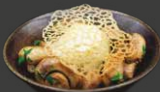
CHAMPIÑONES AL AJILLO