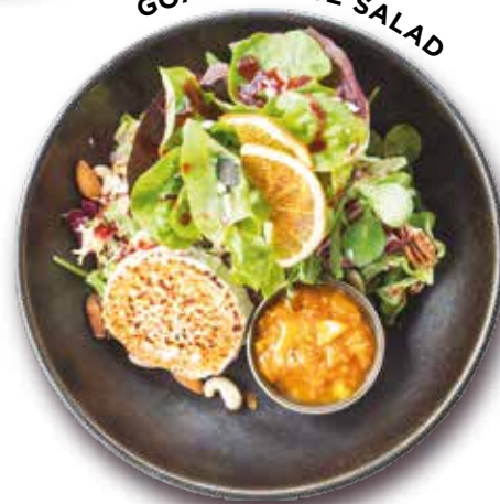
GOAT CHEESE SALAD