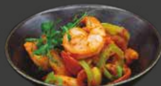
GAMBAS AL AJILLO