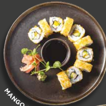
MANGO & TOFU